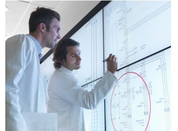
NEC X463UN Videowall Solutions can be fitted with a touch overlay and combined with NEC Desktop Displays to create supersized interactive workspaces

The NEC Display Solutions Professional ('P') Series of displays that range from 40" to 82" and the X461S and X551S (LED Edge lit) Displays are also designed to be used for prolonged periods of time providing sharp clear images for confidence making critical decisions.