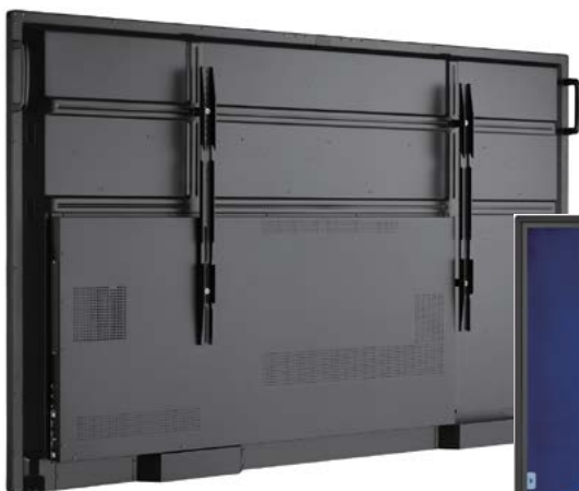
MultiSync® CB861Q / CB751Q / CB651Q